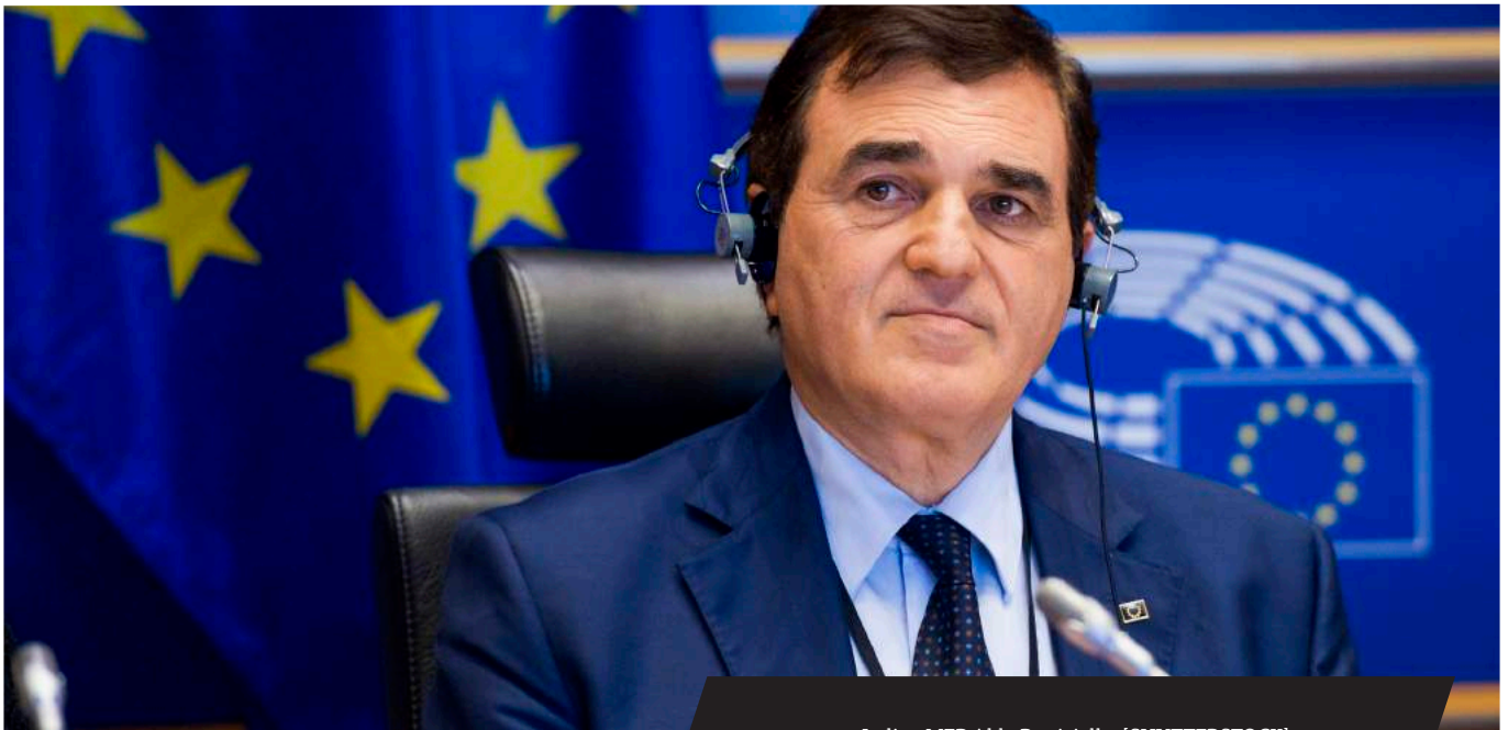
Italian MEP Aldo Patriciello.

Setting ambitious health targets at the European level after the COVID crisis is not only necessary but also dutiful, particularly to combat those diseases that have a negative impact on the life expectancy of citizens, centre-right wing lawmaker Aldo Patriciello told EURACTIV in an interview.=